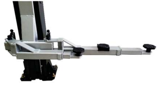
Asymmetric Swing Arm Configuration