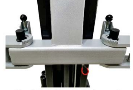
Dual Point Lock Release & Swing Arm Restraints